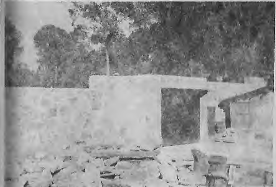
Above: The wall surrounding the Vergel when it was being built (summer 1971)

When Our Lord told me these last words, "that the third foundation of atonement prophesied has already been realized," that is, that it has already been realized in a supernatural manner, He meant that, in His eyes, it was realized although it is not officially in the juridical Church. Although I understood very well, nevertheless I asked Him to explain it, and hence He deigned to do so, telling me textually: "Behold... you have seen many times, and recently even more, that men fail Me constantly. I call them, I give them honorable commissions... and... they do not pay attention to Me. My spouse, one of the sins of humanity has always been, not to hear the voice of their God, of their Creator, of their Lawgiver, of their Redeemer, of their loving